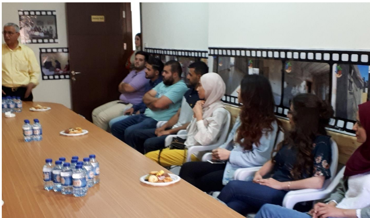
Attending an honoring activity for community volunteers, Askar Refugee Camp.