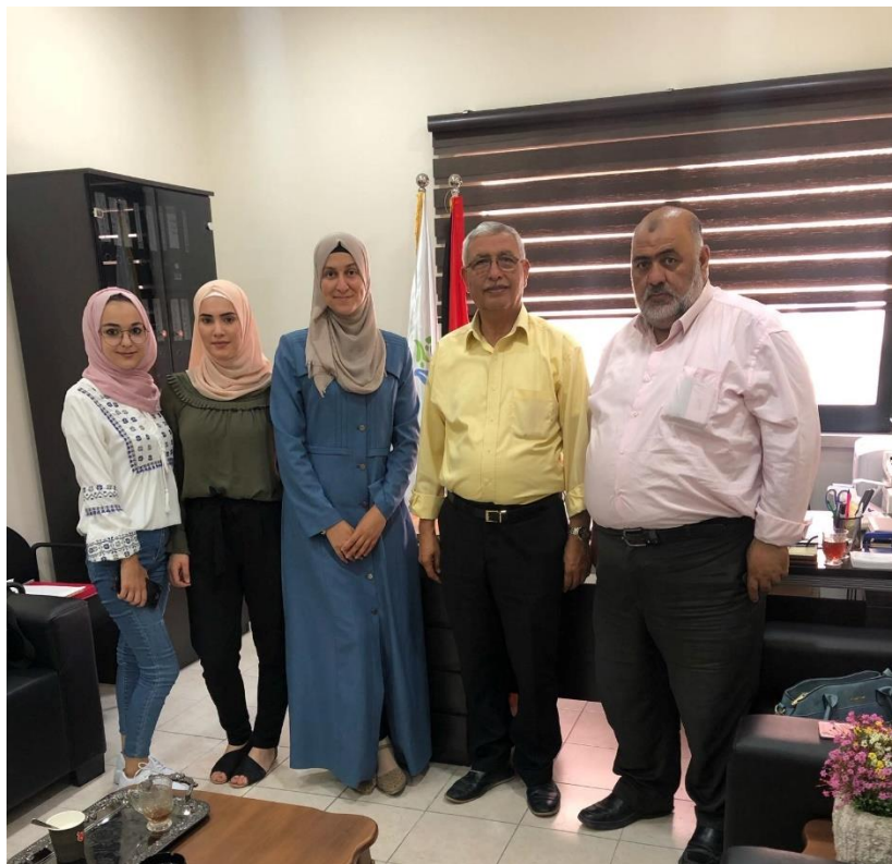
A visit to Safir Society, Askar Reugee camp