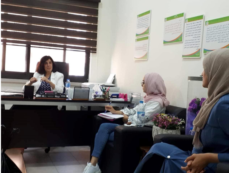
Meeting with Nablus District Deputy-Governor